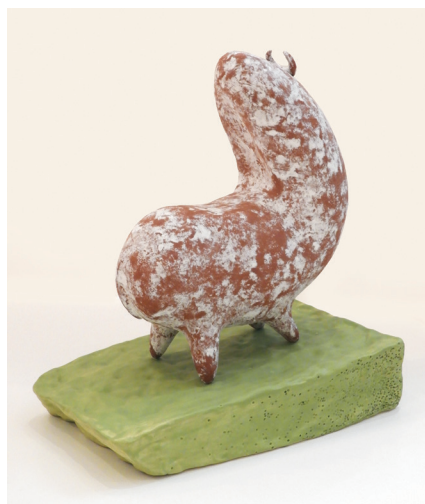
Brian Zimerle | THINGS THAT ARE EXIST | glazed ceramic | 2018