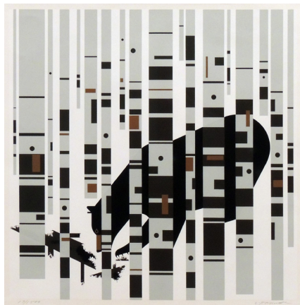
Charley Harper | BEAR IN THE BIRCHES | serigraph on paper

Art & Math: Works from the Permanent Collection at the Springfield Museum of Art is an exhibition for all ages that brings together paintings, prints, and three-dimensional pieces showcasing ways in which artists have applied mathematical concepts and techniques. Included are works by esteemed artists from Ohio and the national scene who have worked in abstract traditions.