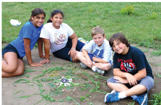
Nature Explorers created art from available objects.