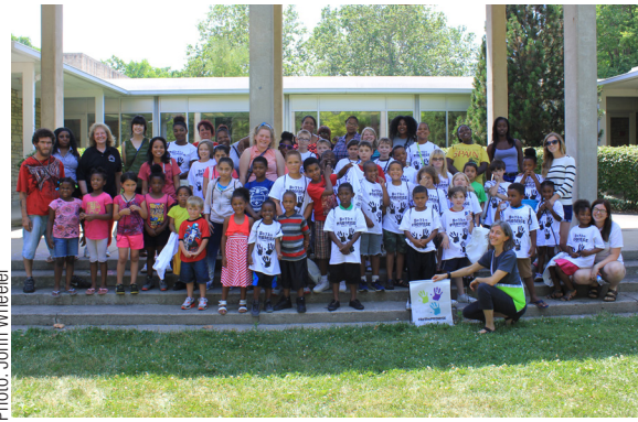
Springfield Promise Neighborhood summer art camp students from Lincoln Elementary School.

Art Instructor Amy Korpieski and Intern Liz Wetterstroem spent two weeks bringing art to Lincoln Elementary School's Summer Program in conjunction with Promise Neighborhood.