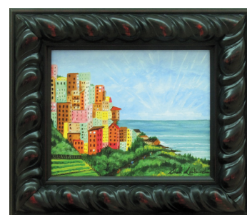
Honorable Mention | Shari Loukoumidis | CORNIGLIA, ITALY | mixed media & acrylic

The Members' Exhibition continues until Sep 4 — don't miss it!