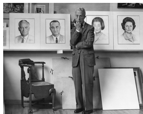
Louis Lamone | PERPLEXED | photograph

Featuring original, candid photographs of America's iconic illustrator Norman Rockwell, this exhibit explores the man behind the canvas through the lens of Louis Lamone. It is a rare and unusual opportunity to get a glimpse of the man who privately, humbly, with dry Yankee wit and much wisdom, showed us a better version of ourselves. Also featured will be more than 95 Saturday Evening Post covers from 1936 to 1963. ■