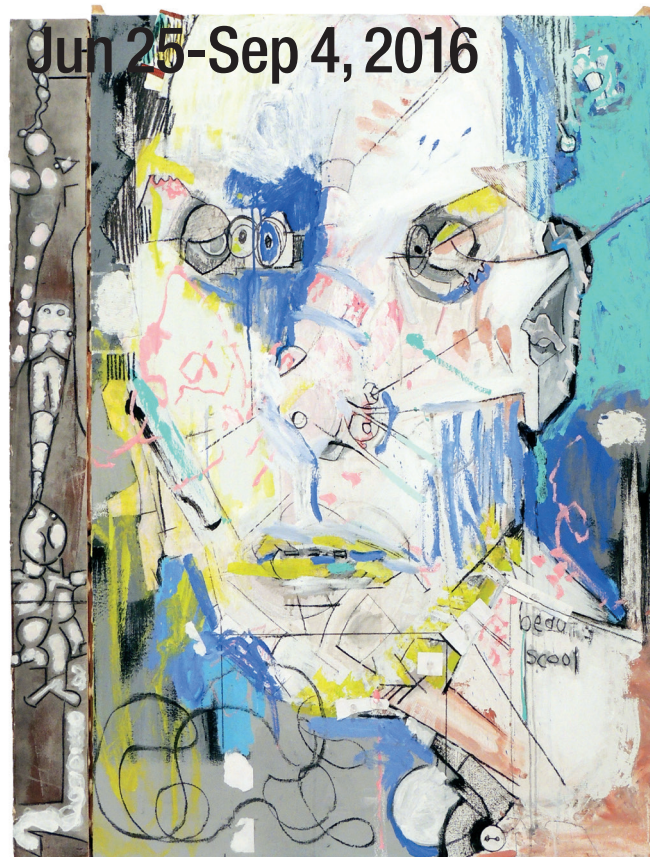
Gary Birdn | PORTRAIT WITH AQUATICS

All current Museum members may enter two pieces of artwork; at least one will be included in the show.