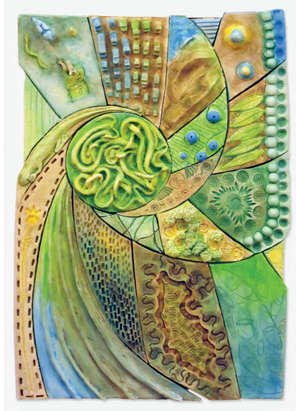
Highlighting the student-curated exhibition is the Unified Inspiration CCHS student's collaborative piece.