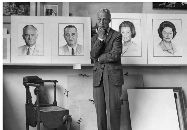
PERPLEXED | photograph | 30 x 24"

More than 100 original, candid photographs of America's iconic illustrator, Norman Rockwell, form the basis of this exhibition, and provide a rare and unusual opportunity to get a candid glimpse of the man behind the wildly popular illustrations. Rockwell needs little introduction, and this exhibit is not meant to be a survey course in Rockwell illustration. It is a rare and unusual opportunity to get a candid glimpse of the man who privately, humbly, with dry Yankee wit and much wisdom, showed us a better version of ourselves. ■