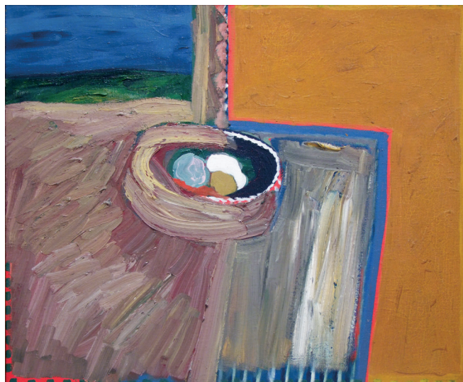
2001.006 | Angelo Ippolito | UNTITLED (STILL LIFE) | oil on linen | 25 x 30" | 1971

This exhibition introduces museum audiences to the remarkable artists who dedicated their creative energy to teaching art as well as creating work of their own. Often these artists weren't given the attention or recognition that their non-teaching peers enjoyed. Find out what is special about an artist who is also a teacher. See more under the EXHIBITIONS tab at springfieldart.net .