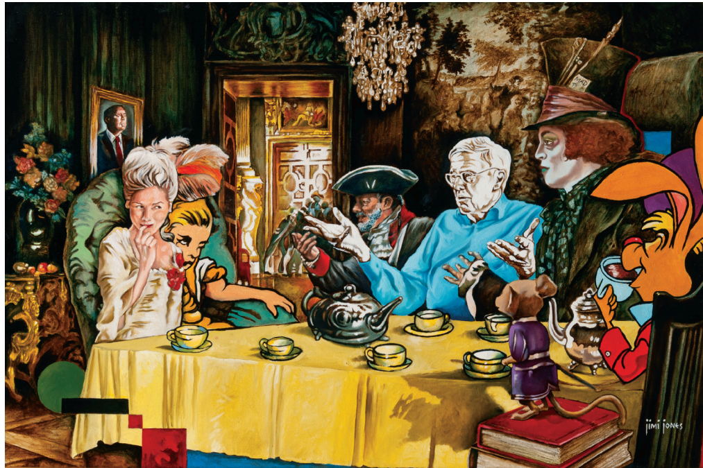
Jimi Jones | MAD TEA PARTY | oil on canvas | 24 x 36" | 2014

The collaged and painted murals and other small paintings tackle socio-cultural issues that resonate with the artist's