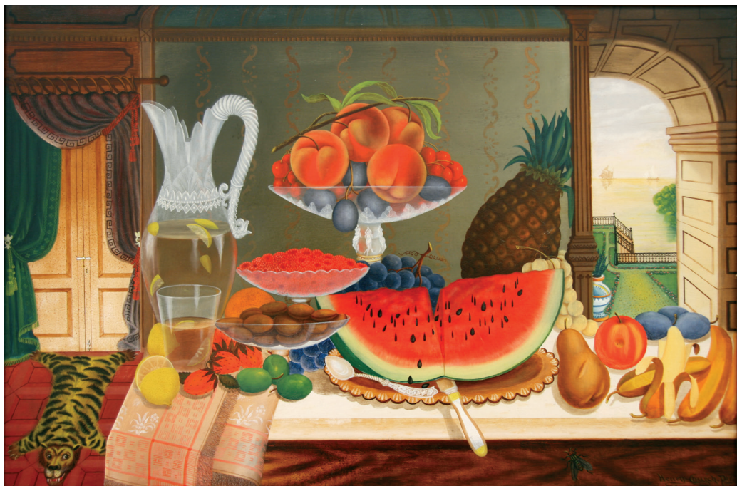
Henry Church | STILL LIFE | oil | c.1870