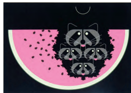
Charley Harper | WATERMELON MOON | serigraph on paper | 12 x 17"

Halley & Klein Galleries through Nov 25, 2018