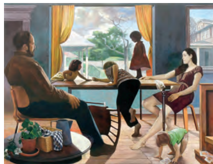
Jeremy Long | OAKWOOD | oil on canvas | 72 x 96" | 2015

Featuring 28 artists and more than 120 works, this exhibition encompasses the vitality and inventiveness present in 21st century painting.