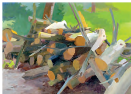
Jean Koeller | WOODPILE (WET) | oil on panel | 20 x 28" | 2017

Jean Koeller's work captures a sense of feeling through paint. Lacking in figures, the works invite the viewer to place themselves within the landscape, offering a sensory experience that is at once nostalgic in its familiarity and intriguing in its sense of discovery.