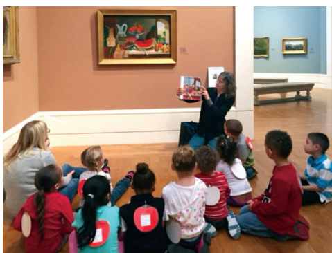
Preschoolers get some of their first exposure to art through the program with Miami Valley Child Development Centers.

Early childhood programs of all types are encouraged to arrange trips to SMOA. More information on Museum field trips can be found at the Museum’s website under the LEARN tab or by calling (937) 325-4673. ■