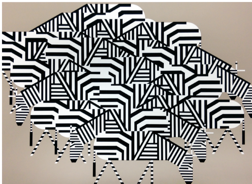
Charley Harper | SERENGETI SPAGHETTI | serigraph on paper | 1979 | 17-1/2 x 24"

Art & Math: Works from the Permanent Collection at the Springfield Museum of Art brings together paintings, prints, and three-dimensional pieces that showcase ways in which artists have applied mathematical concepts and techniques.