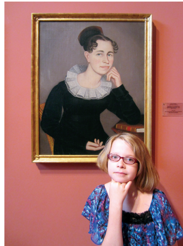
Children from Promise Neighborhood are among those making friends with art.