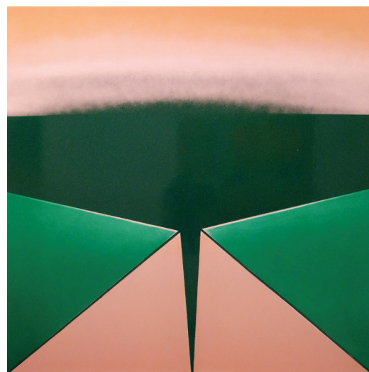
Angelo Ippolito | UNTITLED (GREEN) | 1969

and the interplay of shape and space. Artistic application of mathematics can be seen in architecture and design throughout history and cultures. We see its use in cathedrals,