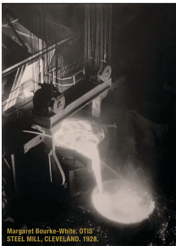
Margaret Bourke-White. OTIS STEEL MILL, CLEVELAND. 1928.