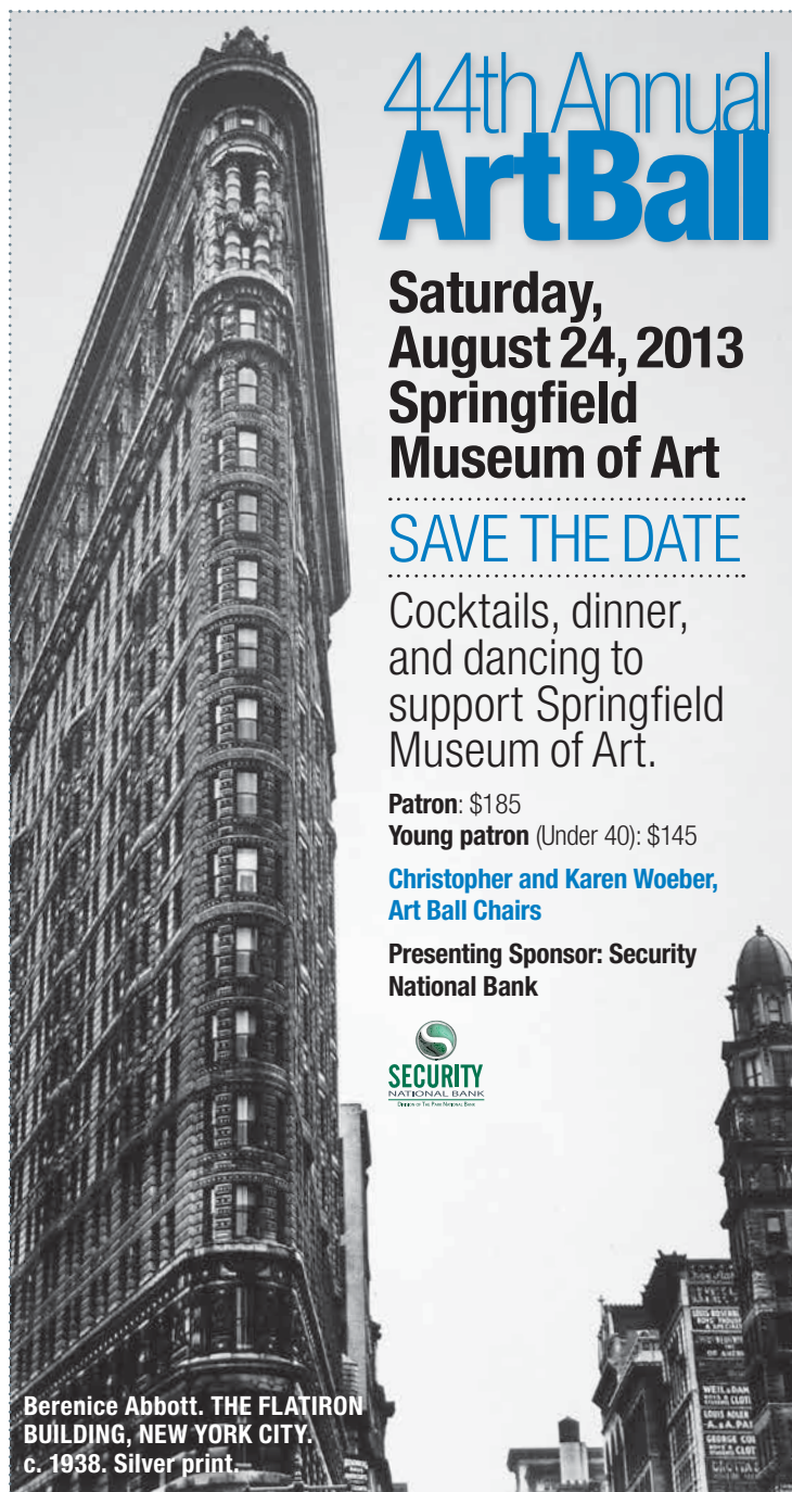
Berenice Abbott. THE FLATIRON BUILDING, NEW YORK CITY. c. 1938. Silver print.