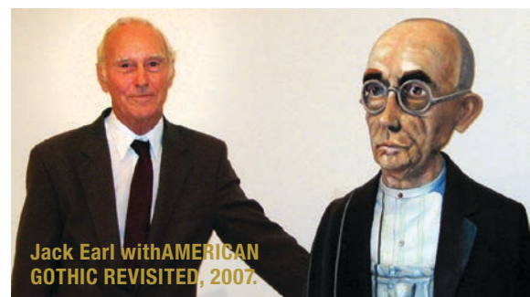
Jack Earl with AMERICAN GOTHIC REVISITED, 2007.

Jack Earl, known for his hard-paste porcelain sculptures, was featured at Springfield Museum of Art in 2012. When the exhibit Jack Earl: Modern Master – opened in September, the Museum showcased a variety of his ceramic and porcelain sculptures. This was the first retrospective of the artist's work ever displayed. Earl's combination of fantasy life and Midwestern imagery show the intricacy and splendor of rural Ohio to audiences everywhere. Still active in his work after five